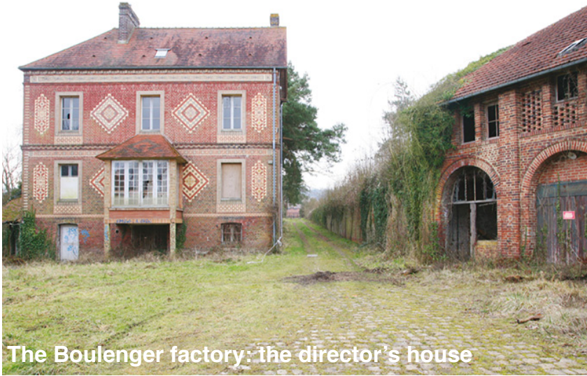
The Boulenger factory: the director's house

The theme of this session raises the question of the urban ecosystem as a paradigm, a paradigm that elucidates milieus and takes us beyond the binary division between town and country. The spectrum of analysis needs to be opened up in order to lay the foundations and generate synergies for a lively and environmentally friendly town.