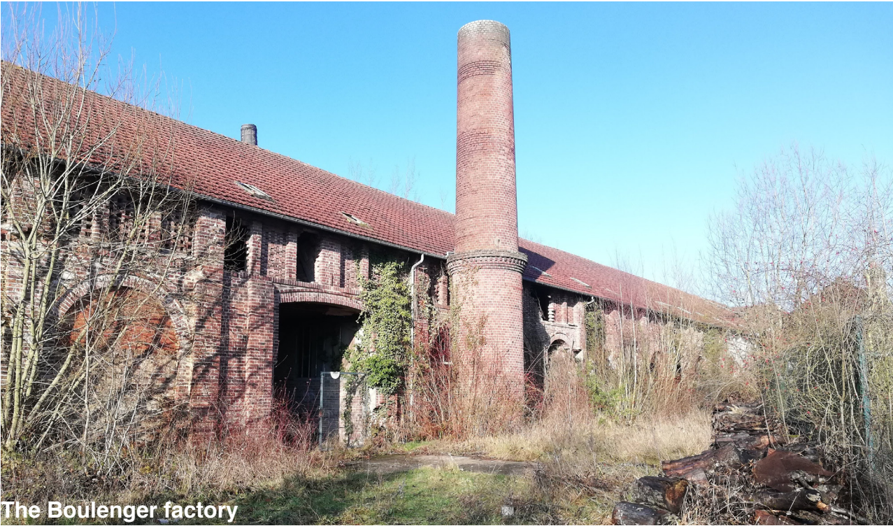
The Boulenger factory