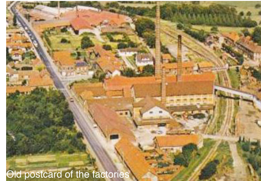
Old postcard of the factories