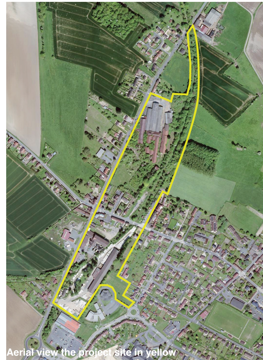
Aerial view the project site in yellow