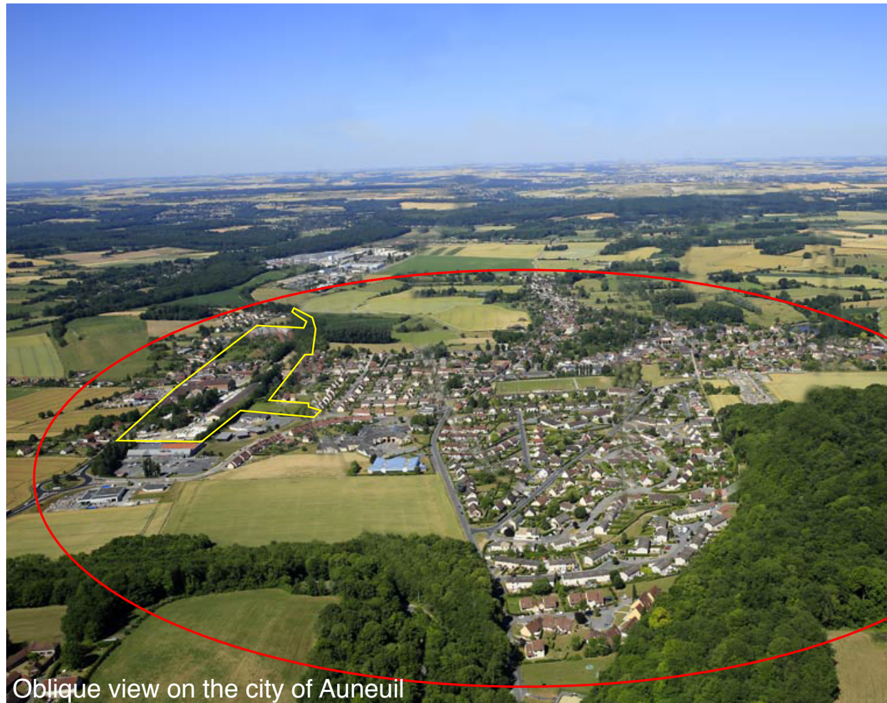
Oblique view on the city of Auneuil

COMMISSION AFTER COMPETITION: urban pre- operational study and/or urban and operational project management of public and landscaped spaces and/or architectural contract