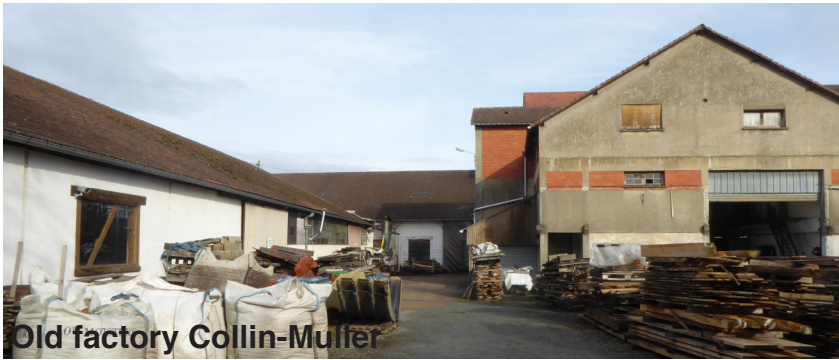
Old factory Collin-Muller