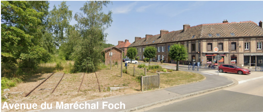
Avenue du Maréchal Foch