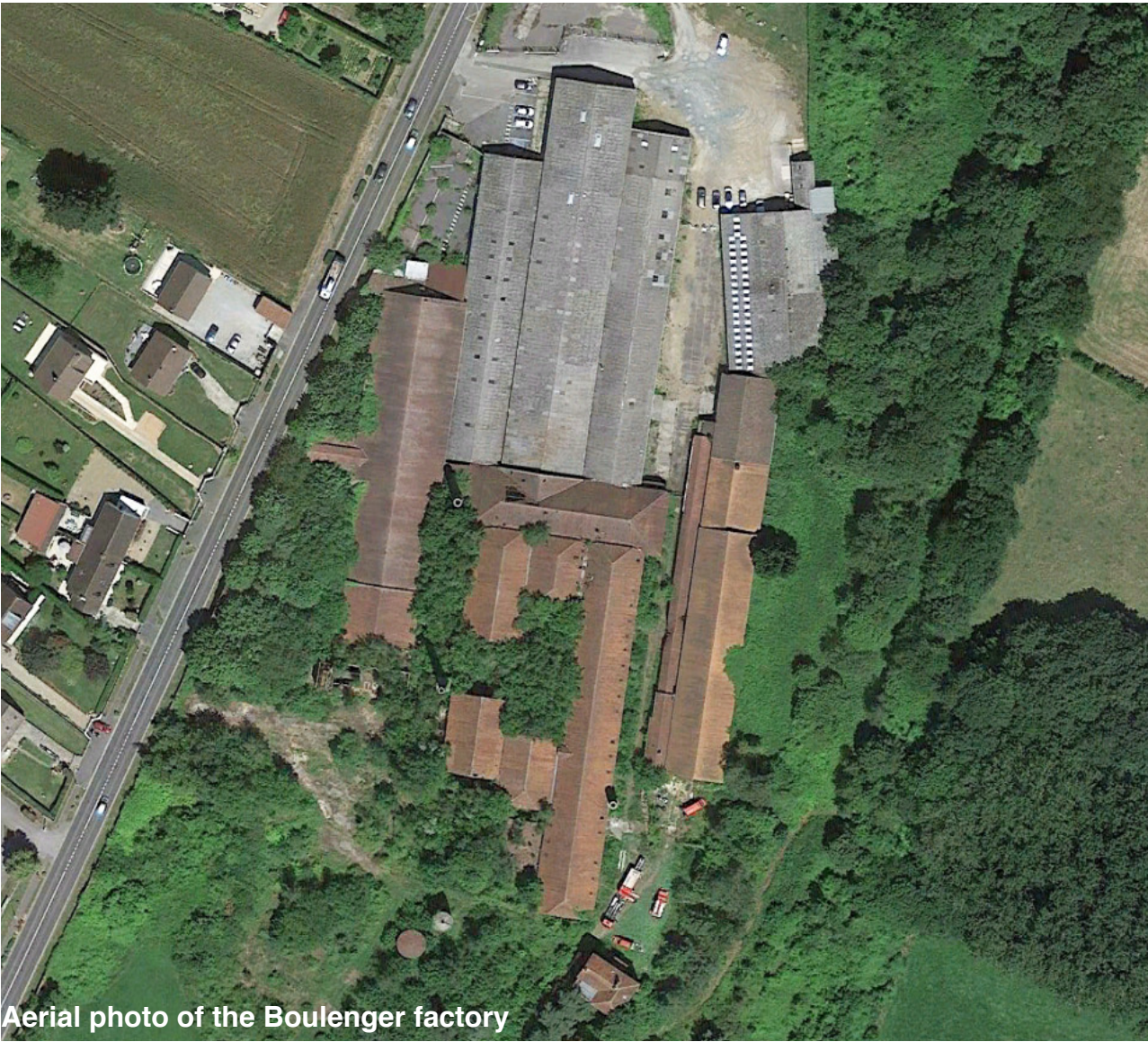
Aerial photo of the Boulenger factory