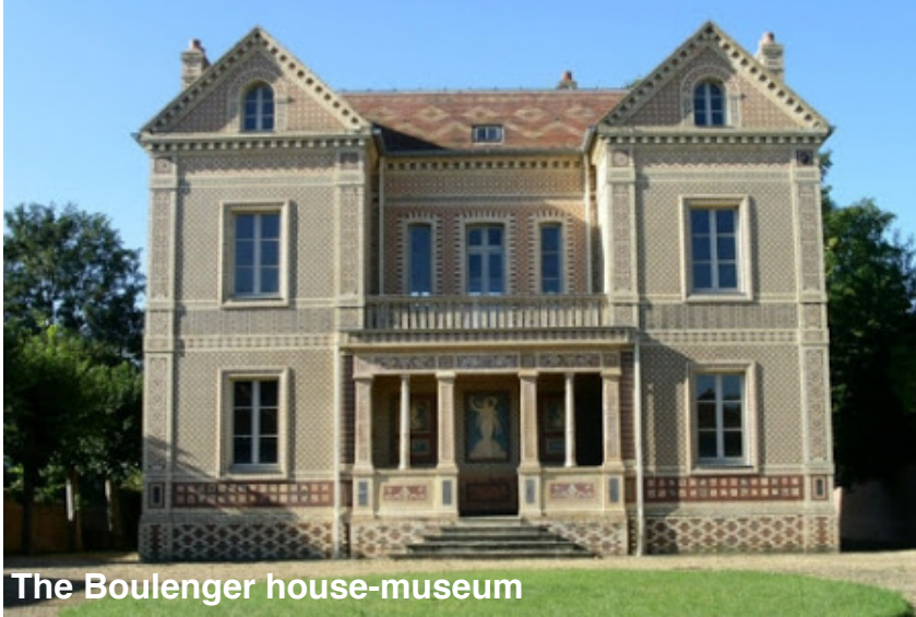
The Boulenger house-museum