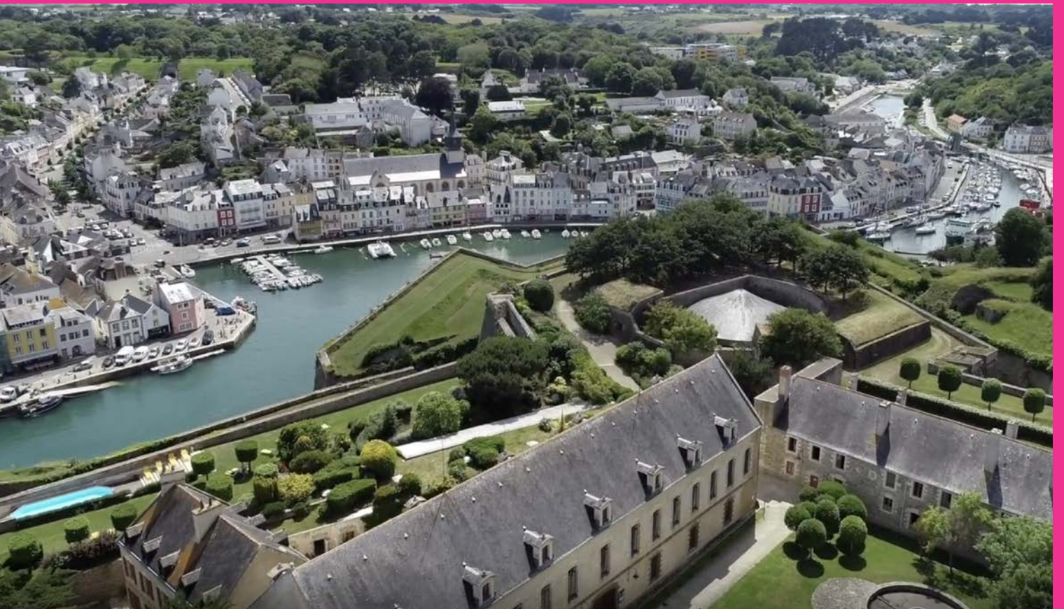
The relationship between the port, the city and Haute-Boulogne