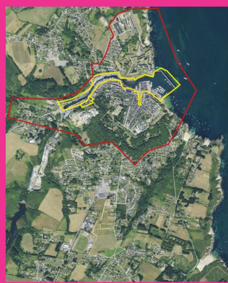
Reflection site: an expanded vision of the city center