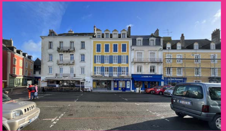
New continuities from the ground of the port to the city center

Finally, Le Palais is looking for a resilience that will bring nature and culture together: global warming, visible in the transformations at work in the island's ecosystem, warns about the impact on its biodiversity. The concept of Care must also be accompanied by appropriate administrative, technical, legal or tax mechanisms. How, through project processes or operational assemblies, can we act on the preservation of biodiversity and maintain the balance between islanders and non-islanders? The actors of Le Palais expect from this session answers leading to new equalizations allowing to find new equities for the living. What are the experiments carried out elsewhere that could find new developments here or what are the new devices to be invented?