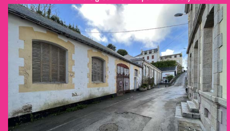
How to reclaim the old market hall