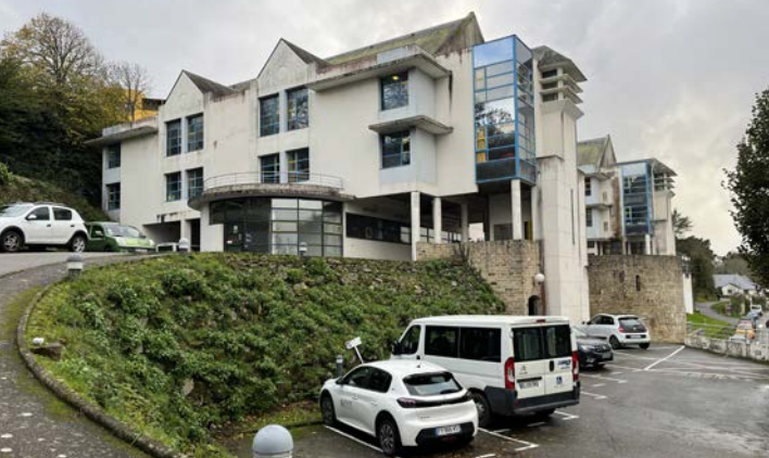
How to transform the site of the medical centrer (FAM)?