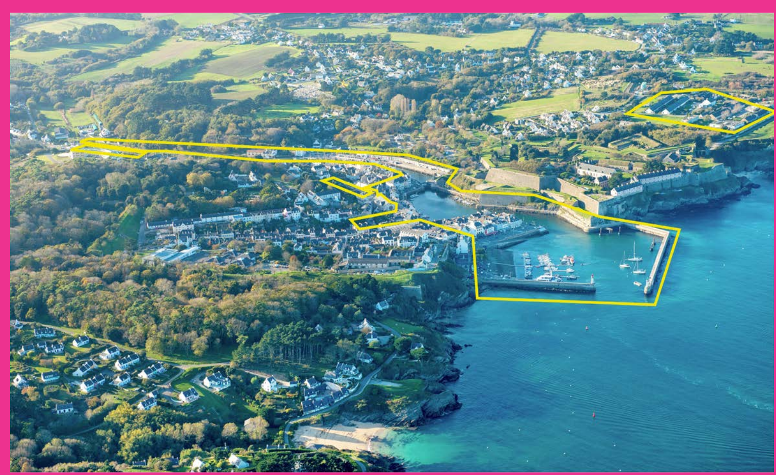
Two perimeters: public spaces and port (including the market Hall and thje medical center) and to the north the former penitentiary centre.