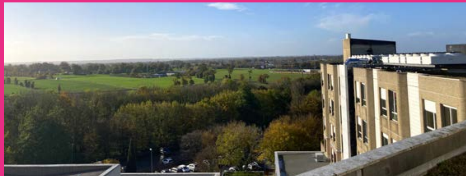
The plateau of Orson seen from the roof of the hospital