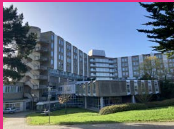
View on the main building

On the scale of the project site: how to revive this site and develop new activities? What to do with this built heritage, between reuse or reconstruction? The site is intended to become a destination, a marker of the metropolitan territory, a place of hospitality for the inhabitants of the Blosne district and the metropolis. Renne Metropolis wishes to make it a demonstrator of the sustainable city, a place of urban intensity offering both a high urban quality, services for daily life, a number of housing units and a particular relationship with nature, with attention paid to the proximity of agriculture and the countryside.