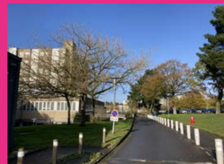
View on the outside spaces