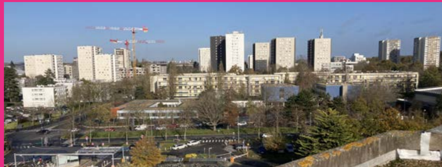
The Blosne district seen from the roof of the hospital